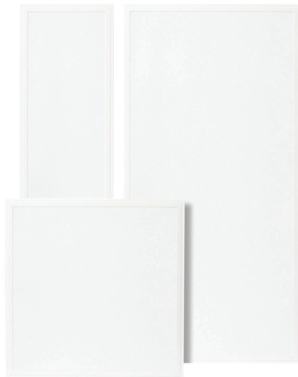
Surface Mount Kit