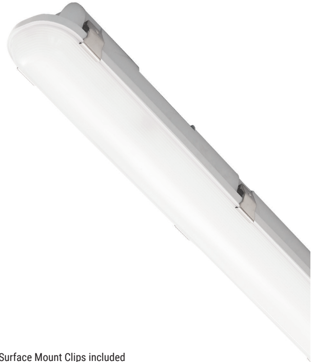
Surface Mount Clips included